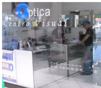
Office front near soda Tio Mano